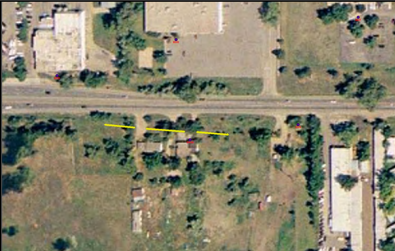
Figure 4: Preliminary Noise Barrier