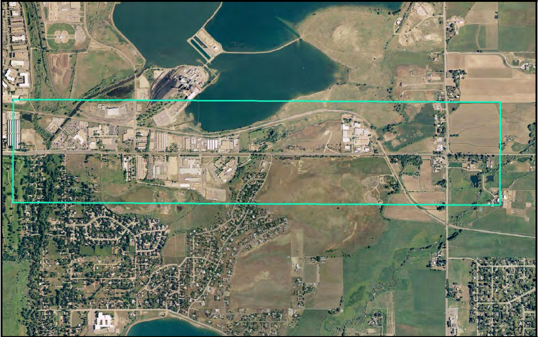
Figure 1: Project Study Area